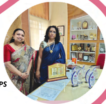
The Golden Book Award Presented to DDMS- PORPS by Ministry of Culture, Govt. of Telangana for the Year - 2021

The school is a centre for online Testing and conducting JEE & NEET exams by National Testing Agency of Govt. of India.