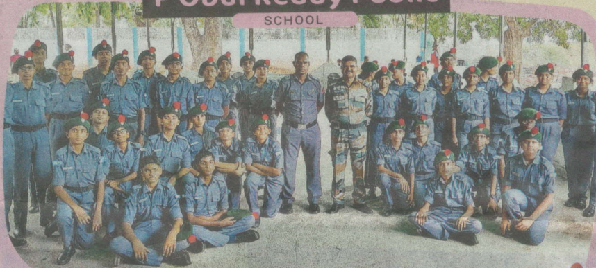
P Obul Reddy Public SCHOOL