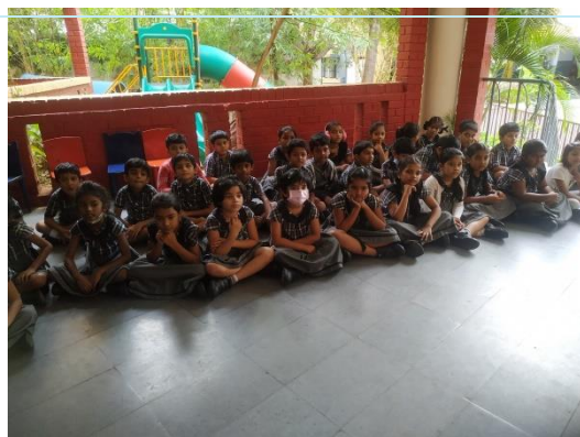
Winners of English Recitation