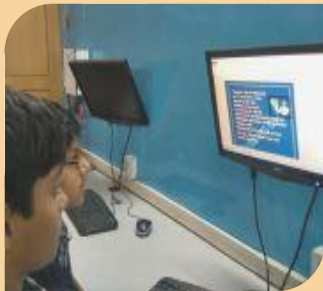
THANK YOU ALL

❖ Assessment : Children created different Ms Word documents like teachers day invitations ,articles on teachers day etc using different tools of Ms Word Tools.