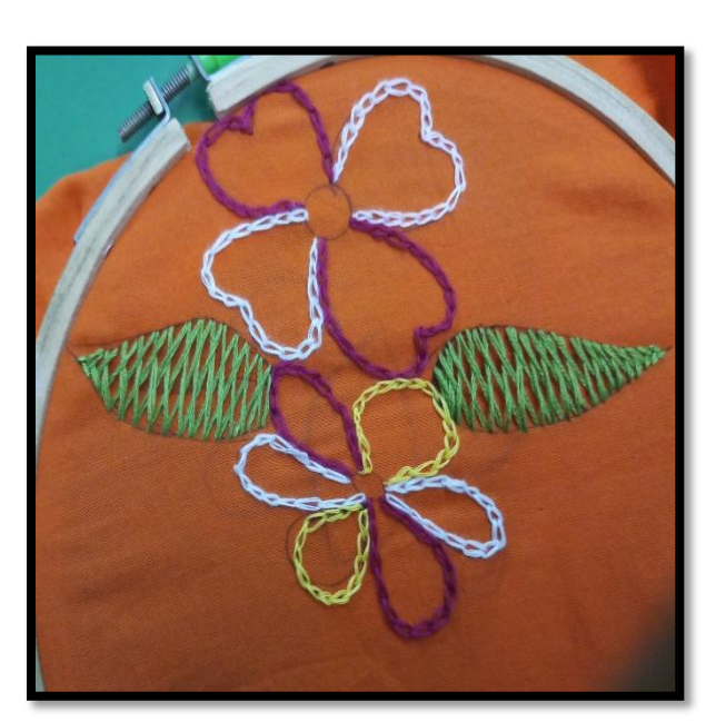
Chain and Fish Bone Stitch