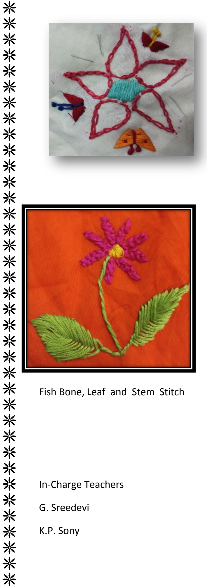
Fish Bone, Leaf and Stem Stitch