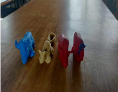
Harappan civilization toys